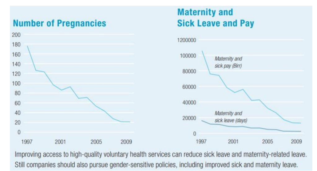
Figure 1 Impact of FGAE Clinic on Kombolcha Textile Factory from FGAE

The Kombolcha Textile Factory in Ethiopia, which employs more than 2,200 workers, half of whom are women, partnered with the Family Guidance Association of Ethiopia (FGAE), to set up clinics for workers delivering a wide range of sexual and reproductive health services. This partnership was spurred by the high rate of unintended