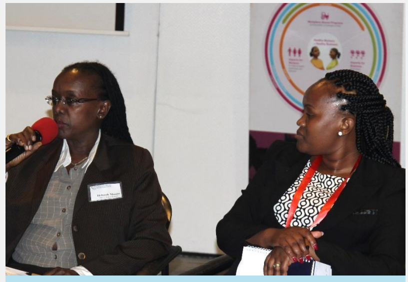
MSK and Magana Flowers discussing workplace women's health at 2019 UNF Nairobi Meeting

At a 2019 meeting in Nairobi hosted by the United Nations Foundation, several companies shared why have begun investing in workplace women's health and empowerment programs<sup>xxxvii</sup>. Gacharage Tea Factory provided health information and services to workers and found increased productivity, and increased quality of their product, which in turn increased the incomes generated when selling the product. They also saw increased voluntary medical visits by farmers and observed an interesting trickle-down