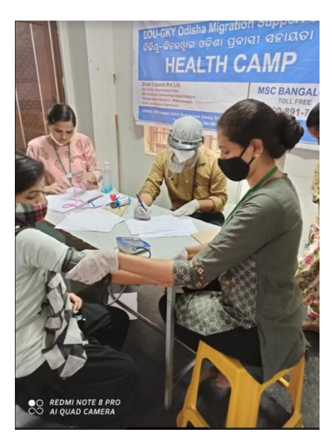
Health care services at Shahi's Migration Support Center

Shahi has also been partnering with Good Business Lab (GBL) to conduct research on the role major employers of women, such as garment factories, can play in improving access to sexual and reproductive health services. It is developing a peer-to-peer support curriculum for these services, which will be implemented in small groups of 10 workers meeting weekly over four months. GBL will evaluate this group against a control group in a randomized controlled trial and then evaluate the change in knowledge, behavior, and attitude of workers toward sexual