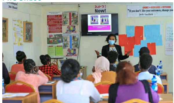
Train the Trainer program on women's health and rights

Since its commitment in 2020, EHPEA has reached 6,500 workers, 75 percent of whom are women, with information on preventing workplace sexual harassment and gender-based violence as well as information on family planning, nutrition, hygiene, and sanitation; three-quarters of the workers reached were women. In partnership with the Family Guidance Association of Ethiopia, EHPEA built capacity and skills for 11 farm nurses on 10 farms to provide voluntary contraception, including long-acting methods, and cervical cancer screenings for women workers. More than 700 women have had a screening. EHPEA also conducted three outreach and advocacy workshops with local government stakeholders