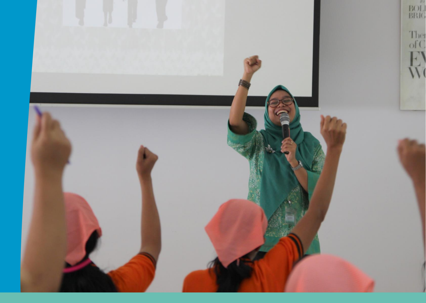
Staying the Course Amid COVID-19: Private Sector Action for Women's Health and Empowerment Progress Report 2021